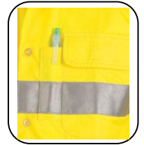
Detail of twin velcro chest pocket