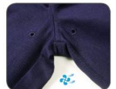
Airflow eyelets between legs