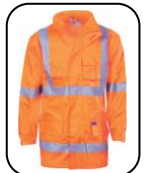
Matching jacket 3995