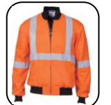
Matching jacket 3759